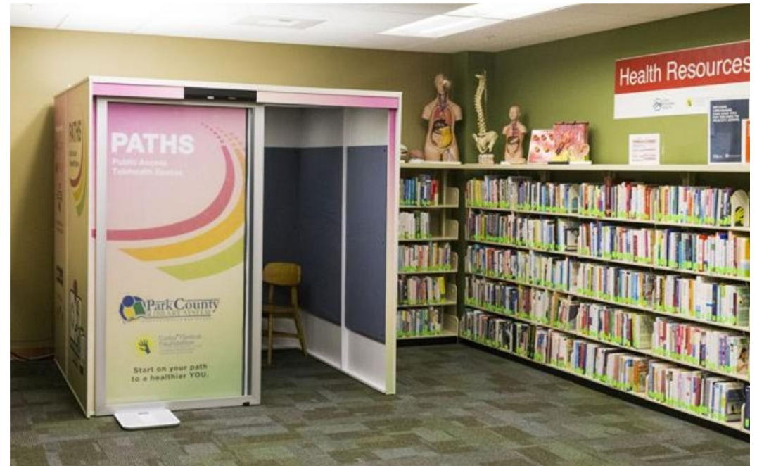
Park County Library, Cody, WY