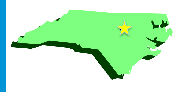
North Carolina: Telemedicine Location

The provider rendering medical services via telemedicine must submit claims to the Plan in whose Service Area the provider is physically located when performing the services.